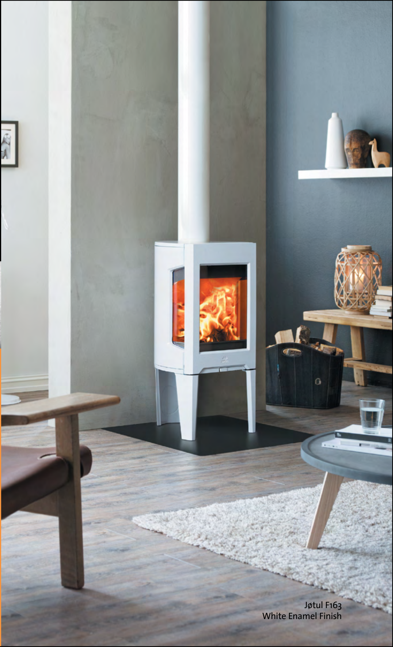
Jøtul F163 White Enamel Finish